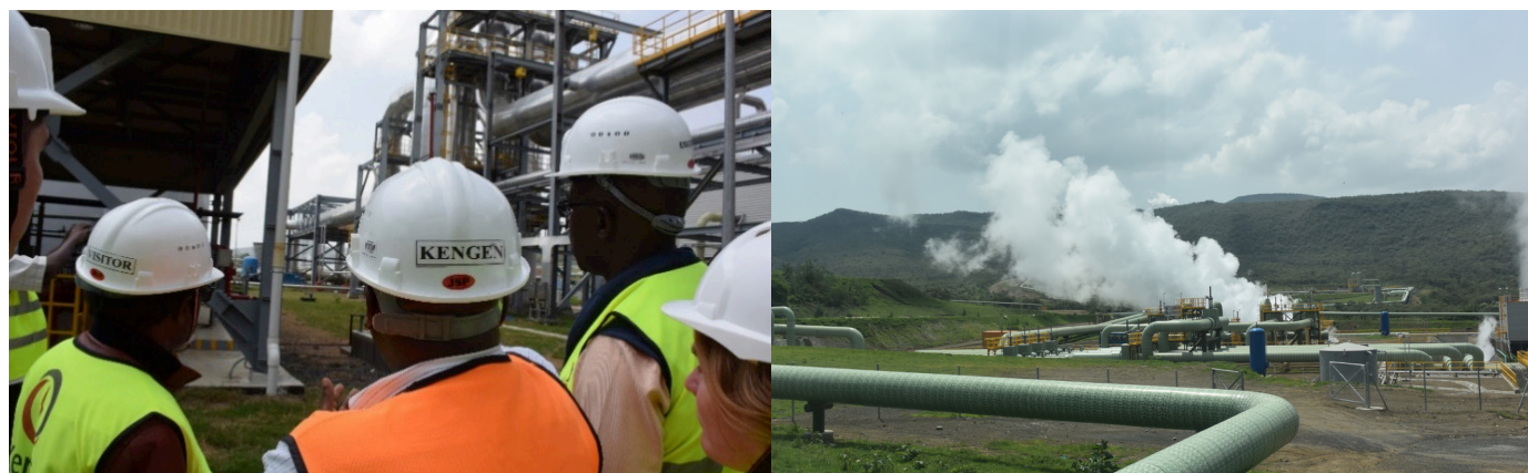
A tour of Olkaria Geothermal Complex and Power Station in Nakuru, Kenya, for meeting attendees

At COP21, GGA Members and Partners will articulate the first elements of the GGA work programme and develop some of the GGA’s concrete actions.